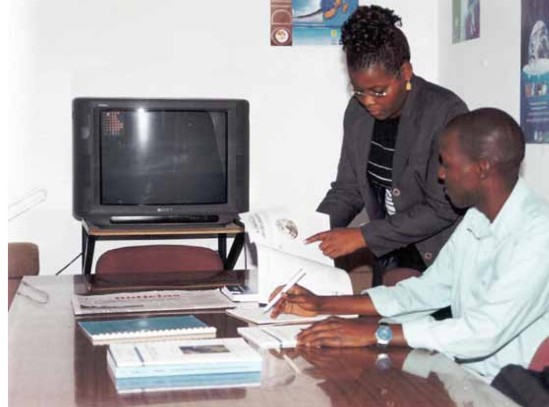
Figure 6. INAHINA Library and information centre.

Experts taking part in a national assessment of environmental and social issues and impacts identified a number of hot spots (currently suffering measurable degradation), sensitive areas (likely to be subjected