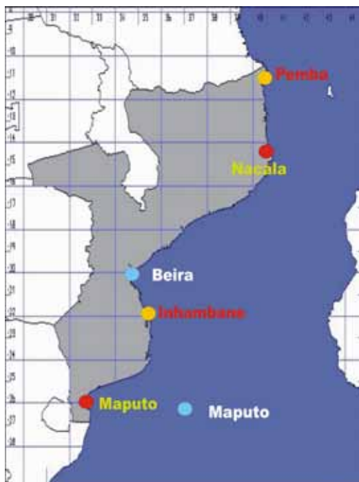
Figure 3. Installation of the various types of tide stations in Mozambique. Red indicates the locations where the OTT R20 tide type were installed; yellow is the locations where the radar tide gauges were installed (GLOSS stations), and blue is the stations where INAHINA installed the radar tide gauges.