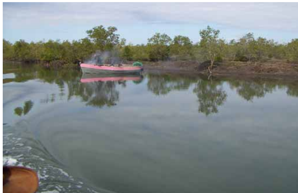
Figure 4. Mangroves destroyed for use as firewood.

Coastal Economy: Mozambique has a long coast which is one of its greatest economic assets. Tourism and fisheries are the principle economic activities, with tourism being one of the fastest emerging sectors, driven largely from South African tourists. The major centres on the coast are: Ponta de Ouro, Inhaca, Tofo, Pomene, Bazaruto and Quirimbas. The coast of Mozambique is one of its main assets. The fishing industry plays an important role in the country's economy.