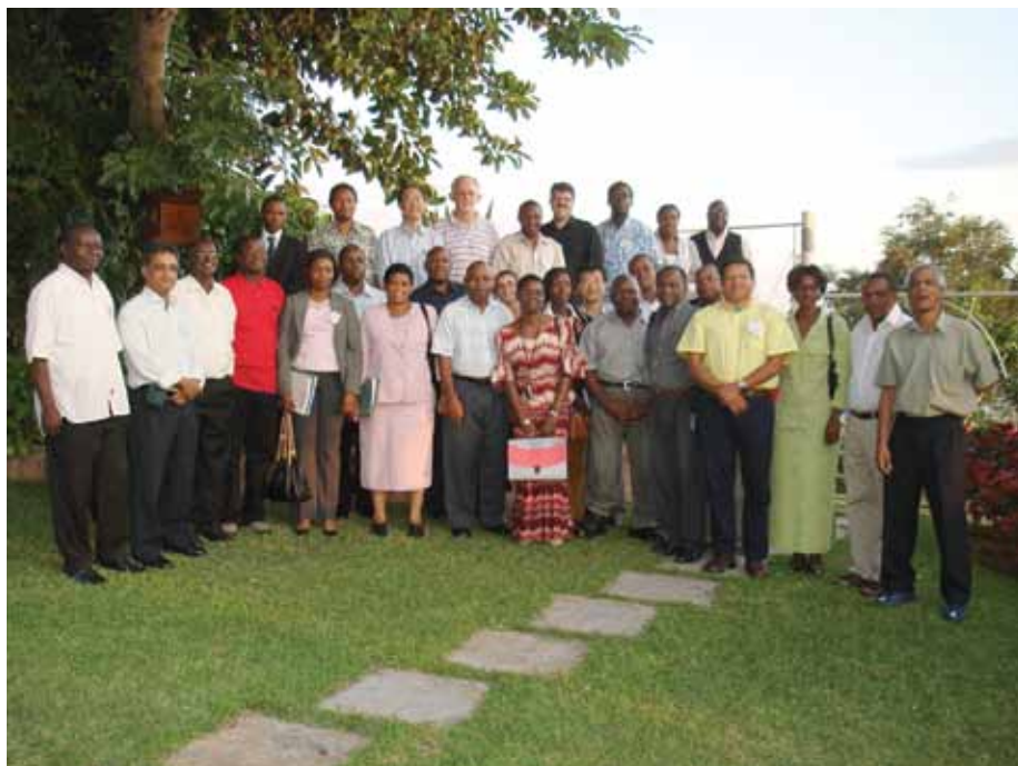
Figure 8. Participants at an “Advanced Leadership Workshop for heads of Marine institutions” hosted by INAHINA and INAM in Maputo, 2008.

Data collected under the National Institutions’ mandate includes: sea level data, water transparency, sediments, and Conductive Temperature Depth (CTD) data. Meta-databases include information on: institutions, scientists, coastal districts level information, GIS layers, documents, programmes and projects.