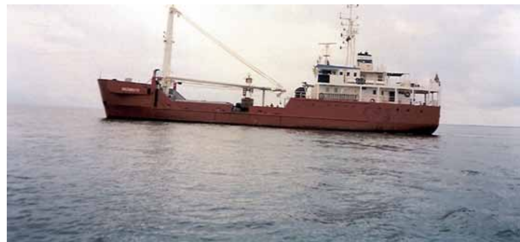
Figure 7. The RV Bazaruto INAHINA's hydrographic survey vessel.