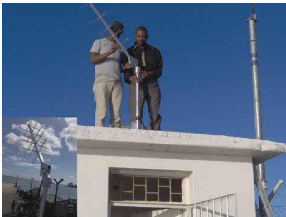
Figure 1. The GPS antenna installed in Inhambane Tide Gauge station.

Coastal Habitats: The coastal ecosystems of Mozambique include mangrove, corals, and seagrass beds, all with significant ecological and socio-economic value. Local communities depend on these coastal habitats and they contribute significantly to the national fisheries. Mangroves contribute at least 250,000 tones of fish to annual production per year, at a rate of 0.5 tones of fish per hectare of mangroves. Corals