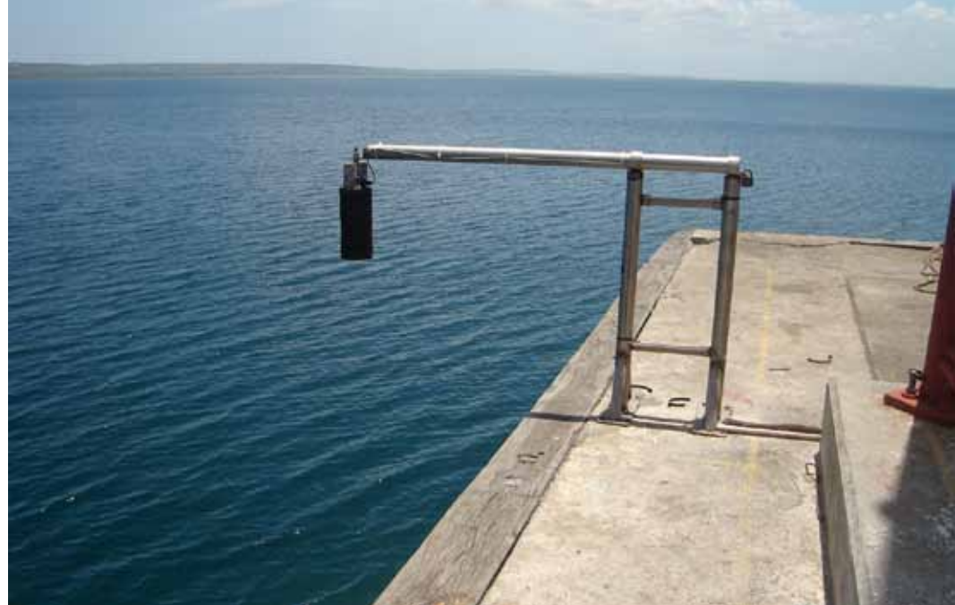
Figure 2. Tide gauge at Kalesto, Pemba Quay, 2006.

are the source of production of an estimated 38,700 tones of fish annually, based on a figure of 25 - 30 tones of fish per km 2 for the 1 290 km 2 of the area of coral (Rodrigues and Motta, in press). About 75,000 artisanal fishermen and mussels' collectors, together with their families, depend at greater extent from the fisheries resources (MICOA, 1998).