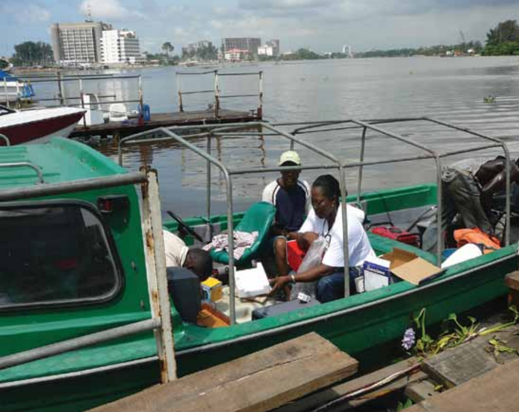
Figure 2. Deploying ADCP in the Lagos lagoon.

along the beach and the predominance of silt and clay size sediments. The coastal plain embodying this area stretches about 20 km inland. Relief ranges from sea level along the coast backed by a wide expanse of tidal flat, wide expanse of coastal plain with relief rising gently from 2 m to about 50 m above mean sea level. The coastal vegetation along the transgressive mud beach is dominated by mangrove, especially the red mangrove Rhizophora racemosa and the white mangrove Avicennia spp. Also present are the hardy grass Paspalum vaginatum , the fern Acrostichum anreum , the palm Phoenix reclinata and various climbers and shrubs.