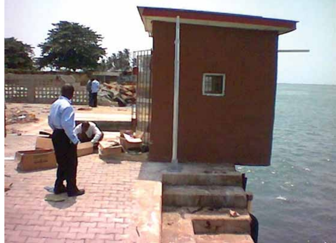
Figure 3. Lagos tide gauge house.

The West-East Guinea current is the dominant ocean current affecting the Nigerian continental margin. The Guinea current, which is an extension of the north Equatorial Counter current, attains speed of 0.3m per second with some reversals. The Guinea current runs above an undercurrent. This is thought to be a westward flowing extension of the northern branch of the Equatorial undercurrent, which splits into two branches after reaching upon the African continent at Sao Tome Island. Due to the fact that the Equatorial undercurrent carries cool,