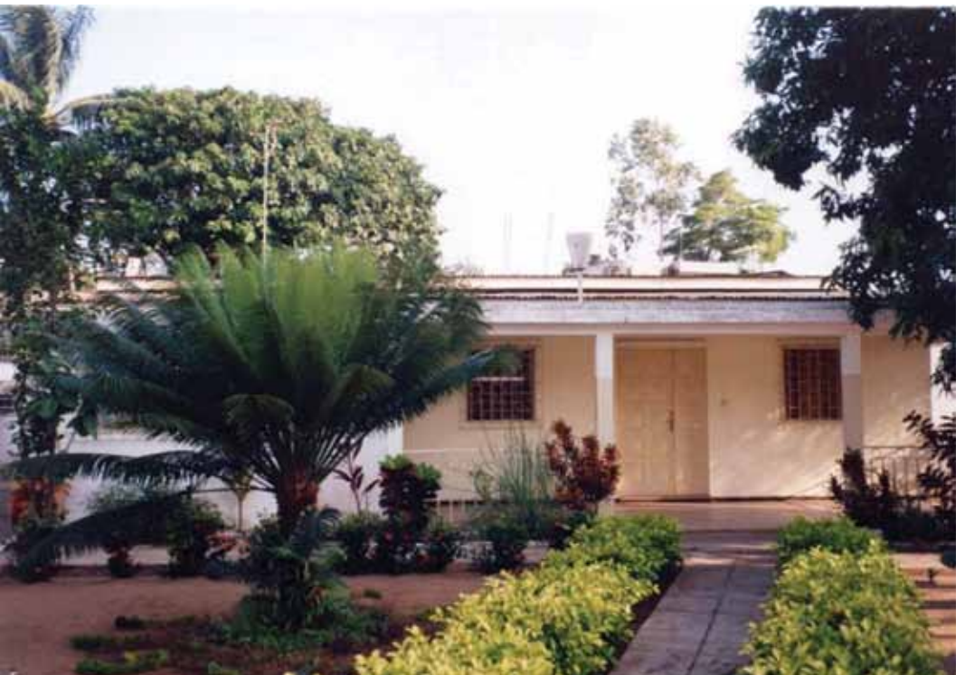
Figure 7. The National Oceanographic Data and Information Centre in Lome, Togo.

the same objectives. The principal users are: