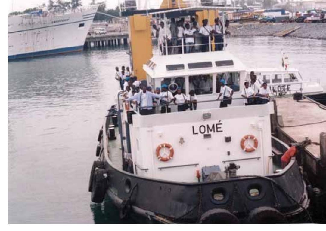
Figure 8. Students on a pilot boat at the Lome port during a public awareness course sponsored by ODINAFRICA.