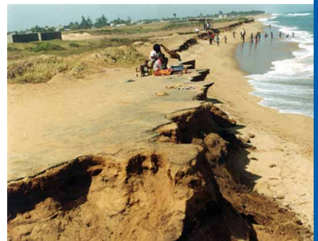
Figure 2. Coastal erosion at a beach on the coast of Togo.

The exploitation of phosphates takes place in the open areas of Hahotoé and Kpogamé. The mineral ore is processed at a plant in Kpémé, situated on the coast. This results in the need for treatment of two types of mineral wastes which comprise 40% of the ore: solid waste composed of coarse particles, and liquid slurries rich in fine particles. These total more than 2.5 million tones per year. Phosphates liquid waste is discharged into the coastal waters without any treatment. The Centre de Gestion Intégrée du Littoral et de l'Environnement de