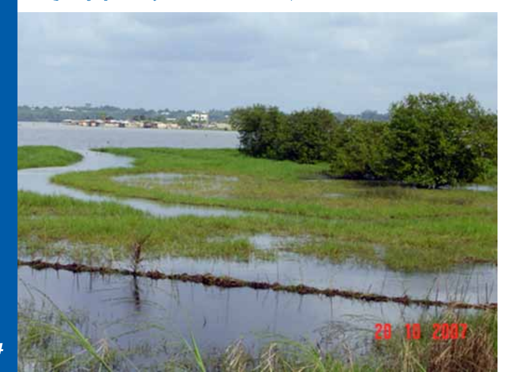
Figure 4. Flooding of the coastal plains consisting of ridges and lagoons (photographer: Prof. A. Blivi, October, 2007).