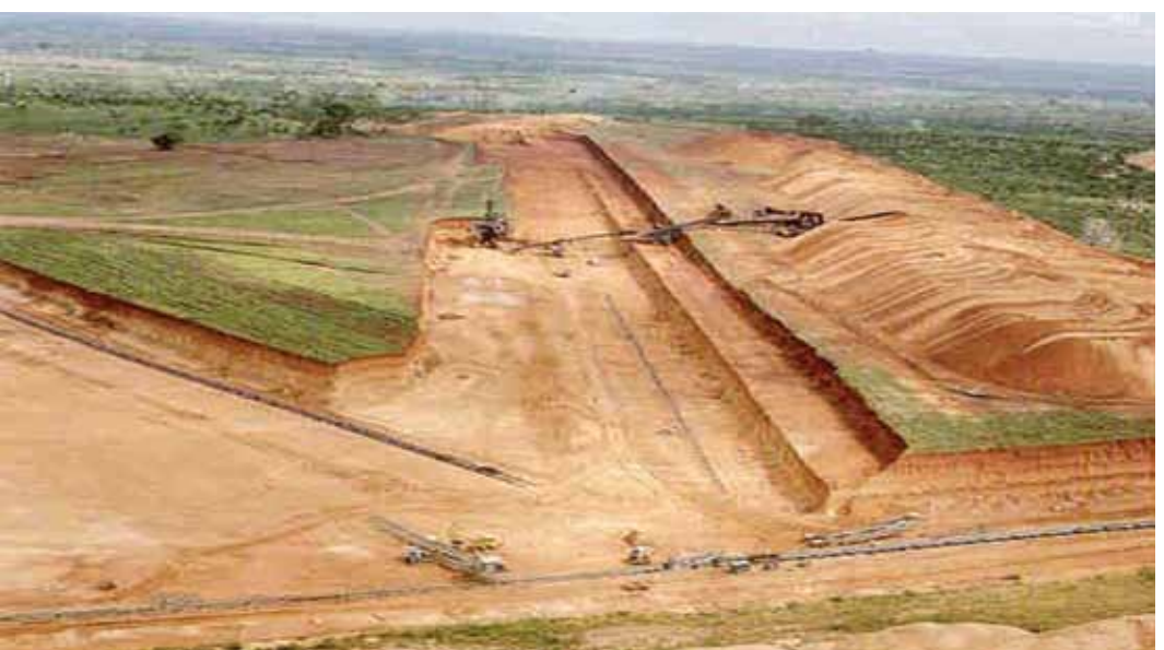
Figure 1. Phosphate mining at Hahotoé-Kpogamé in the north of Lake Togo.

is protected by breakwaters and groynes for 12 km between Kpeme-Gumukope and Aneho.