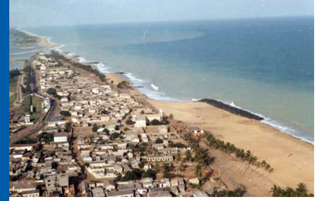
Figure 3. Coastal protection at Aného.