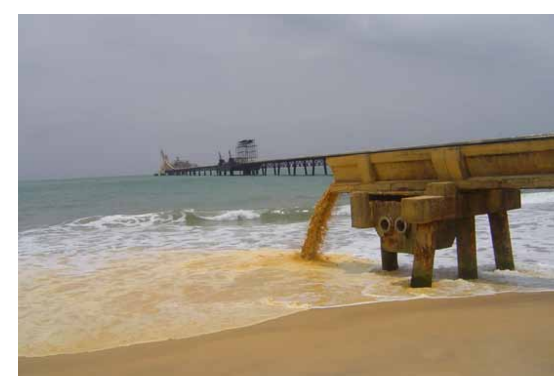
Figure 6. Discharges into the sea from the jetty loading phosphate (photographer: Prof. A. Blivi, August, 2006).