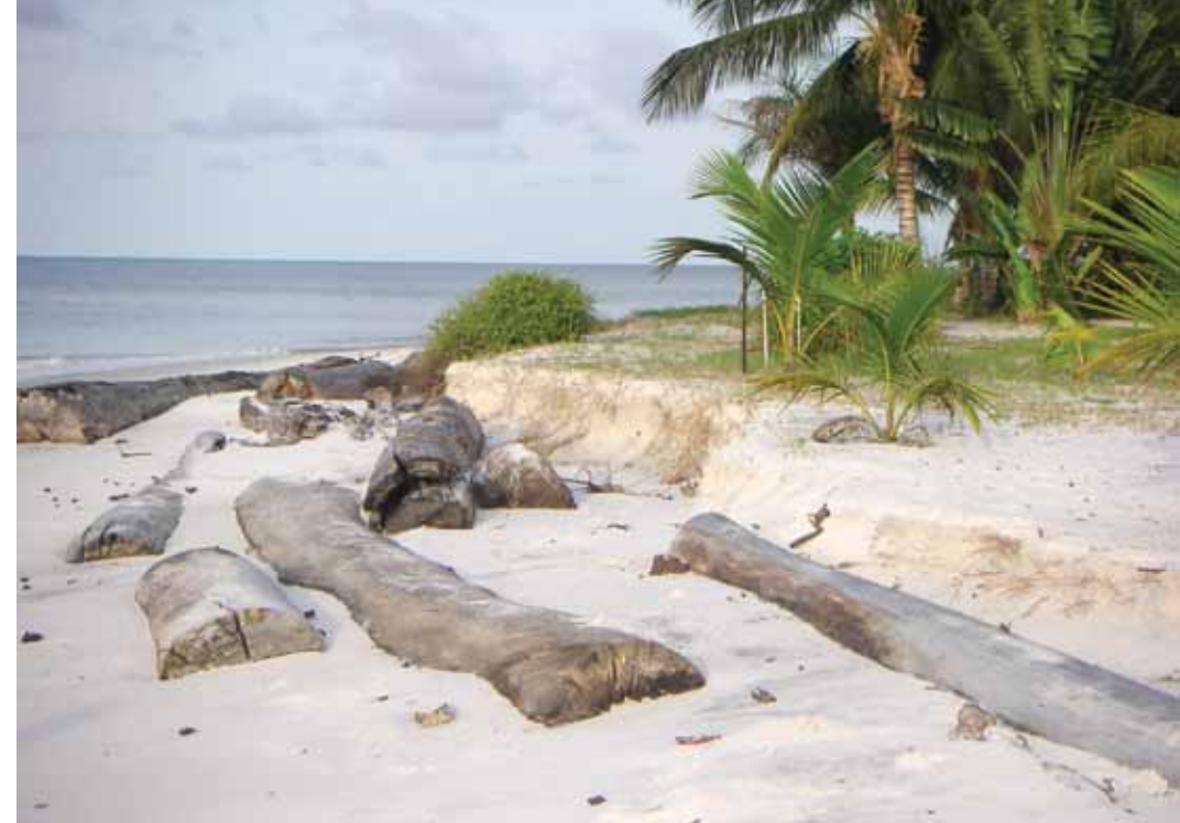
Figure 1. Erosion of a beach in Port-Gentil.

The first unit is a large estuarine area in the north-west, between 1°09' north on the border with the Republic of Equatorial Guinea, and the position of the geographic equator, near the village Nyon. This area comprises three main estuaries: Mouni estuary, Mondah estuary and