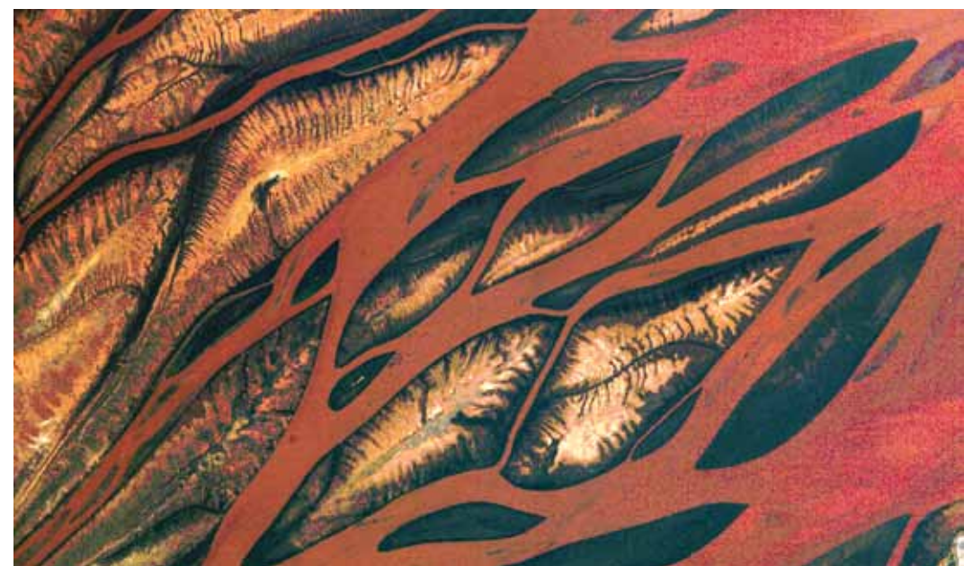
Figure 3. Betsiboka river runs out to the sea - Brick-red lateritic soils, the result of tropical weathering, are responsible for the strong color of the sediments. The sediment lost is an irreplaceable natural asset.