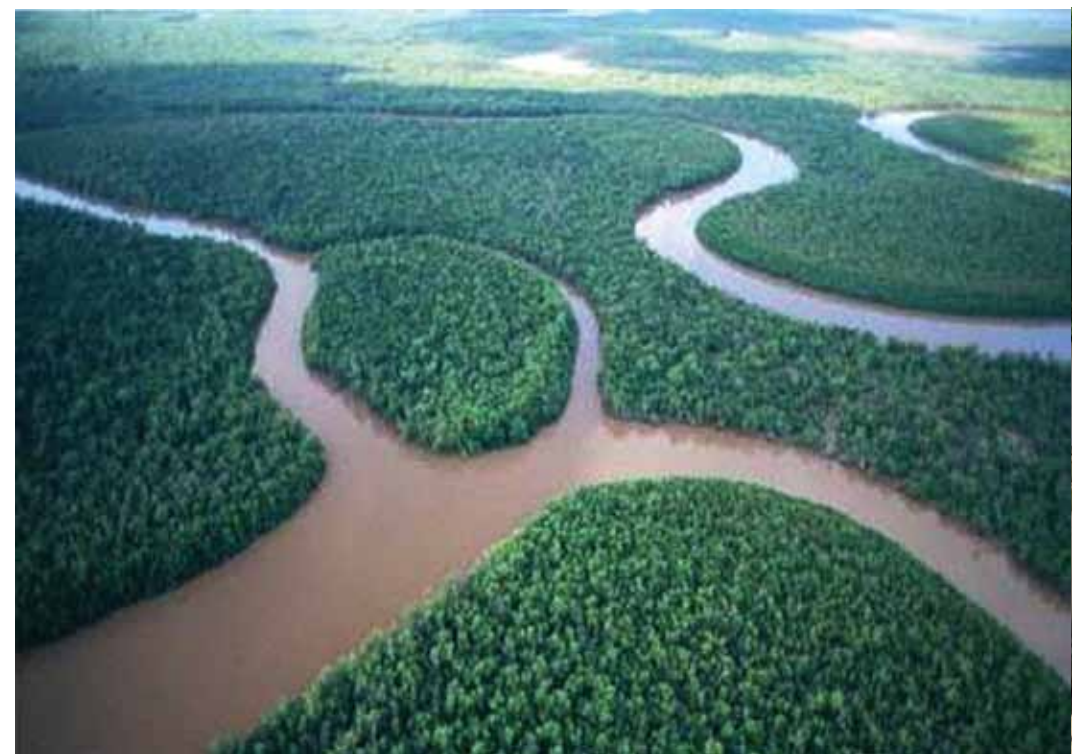
Figure 1. Mangroves swamp of the Bombetoka bay in the northwest coast. Approximately 3 200 tones of lime are produced per year by 27 family of Belobaka village.

Coastal Economy: The coastal economy is mainly based on fishery activities, mineral and offshore oil resources exploitation. Recently, seafood processing industries are developing and since 2004 tourism (including eco-tourism) has become progressively more important. Malagasy Government encourages development of shrimp aquaculture and suitable habitats are increasingly used by the private business sector. Because of relatively low population densities and availability