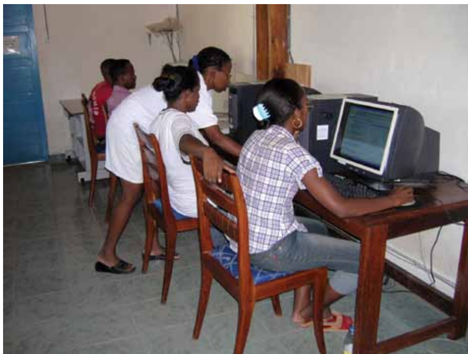
Figure 5. Students using the Madagascar Oceanographic Data Centre facilities.