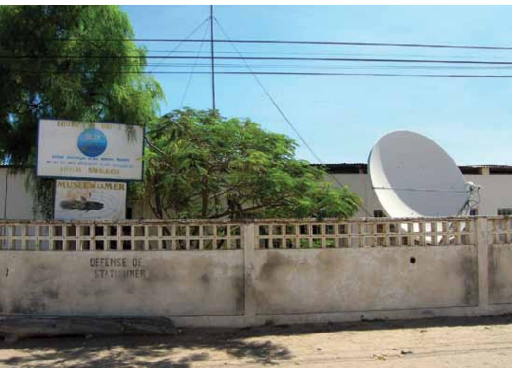
Figure 2. Satellite dish for VSAT link installed at IHSM with ODINAFRICA support.

Due to slash and burn agriculture, only 26% of the land remains forested.